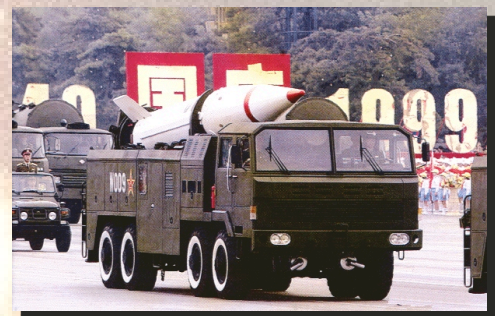
DF-15 SSM, PRC